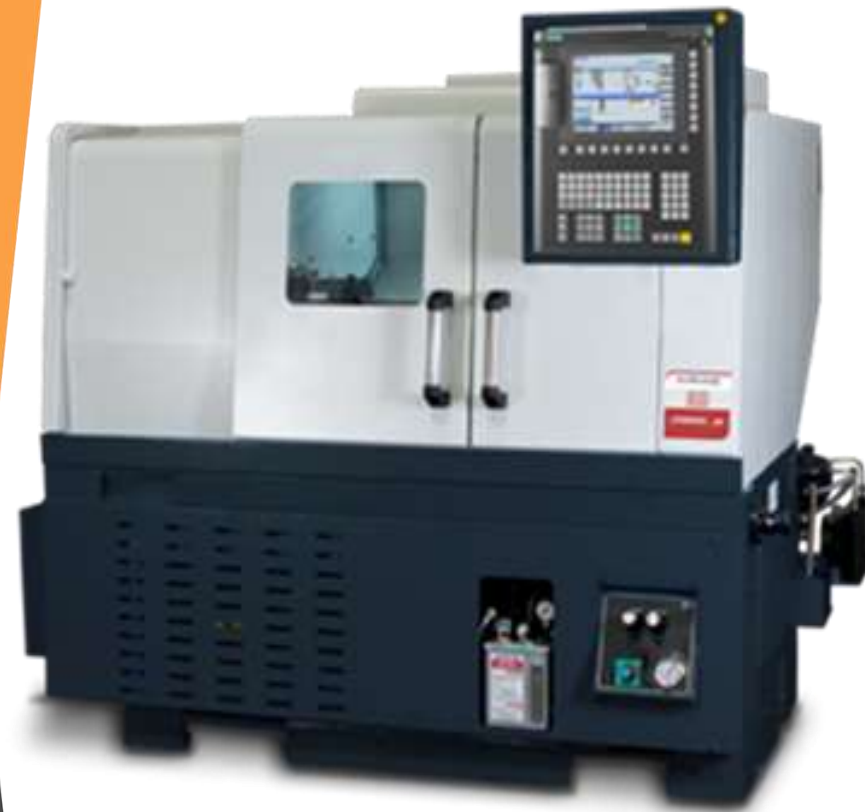
ACE MICROMATIC JOBBER JR