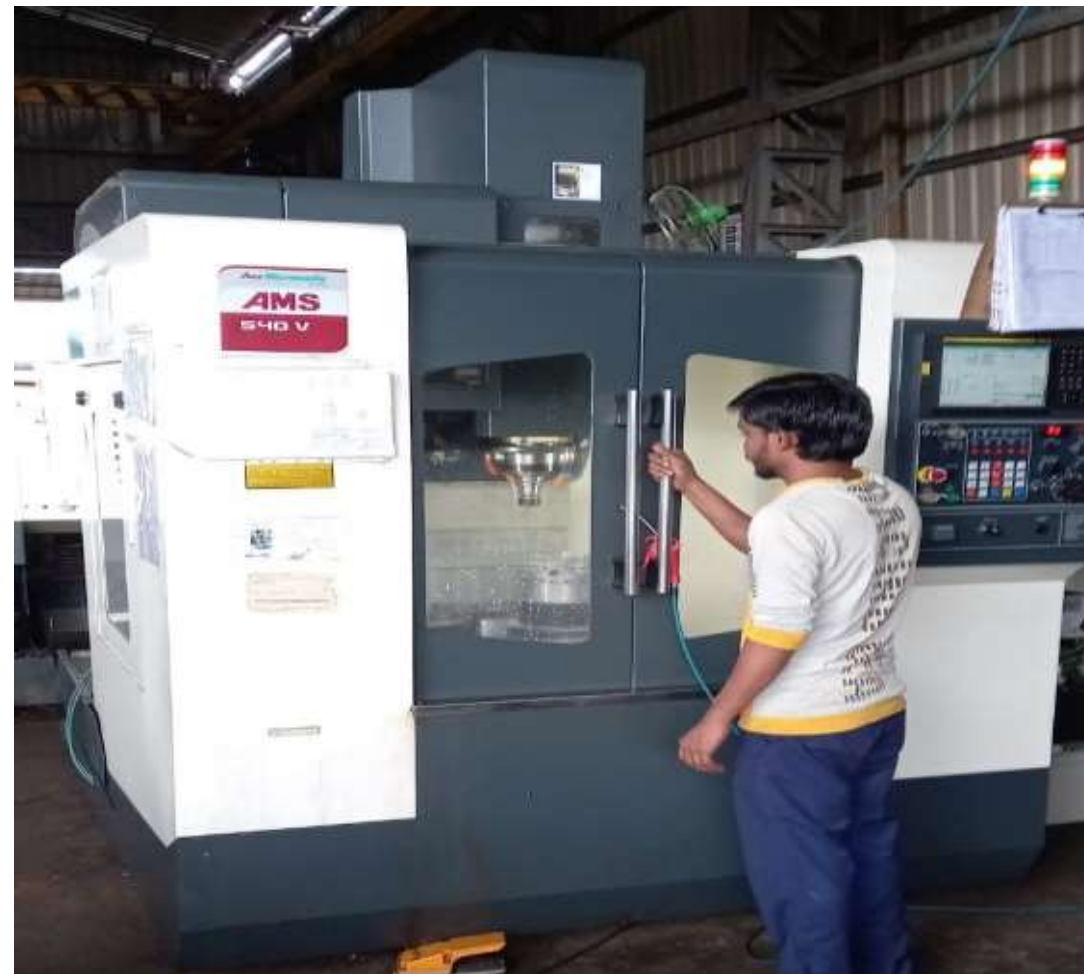
CNC & VMC