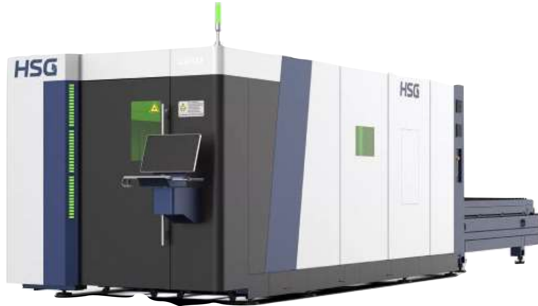
3KW LASER MACHINE (1)