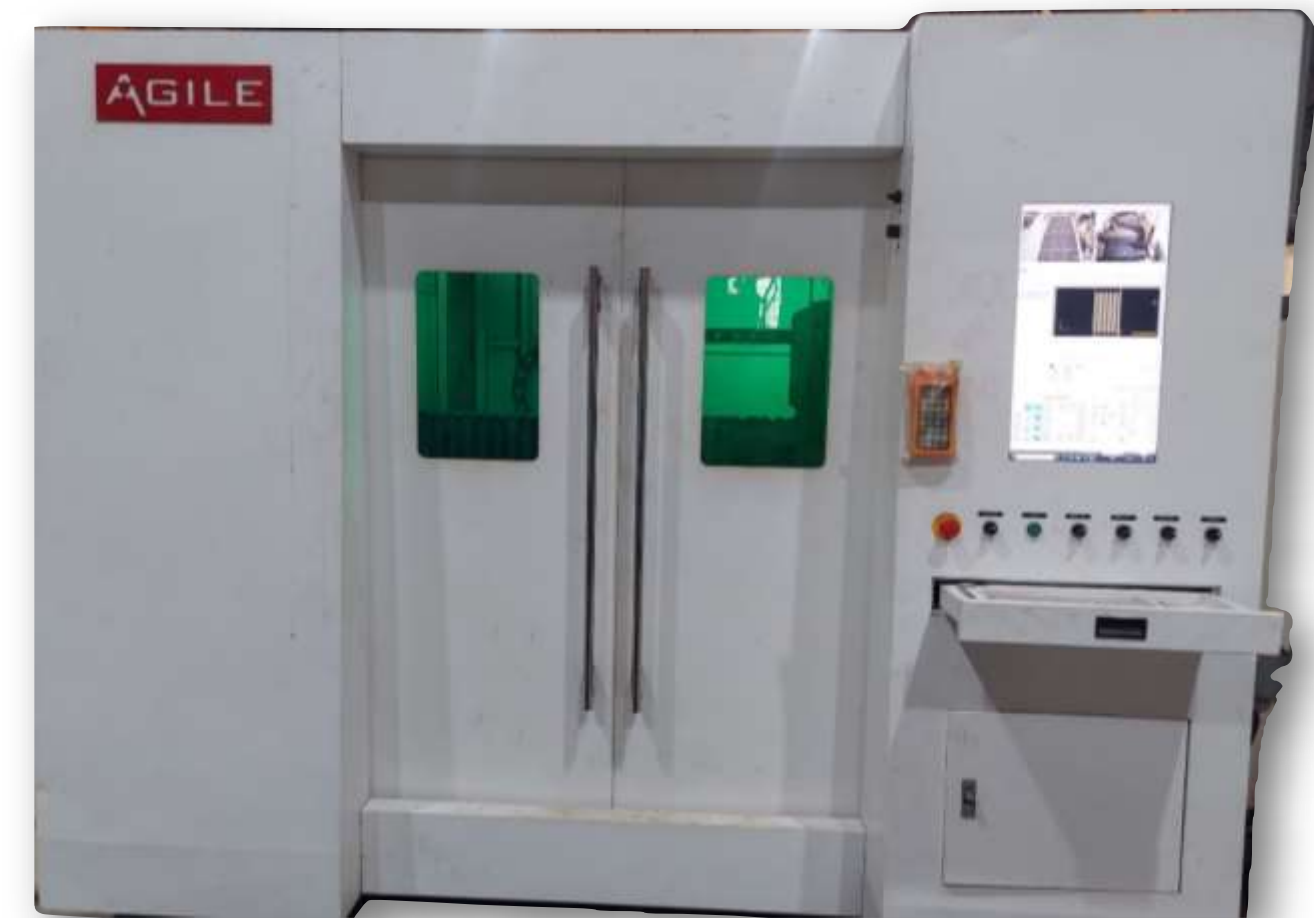
6KW LASER MACHINE (3)